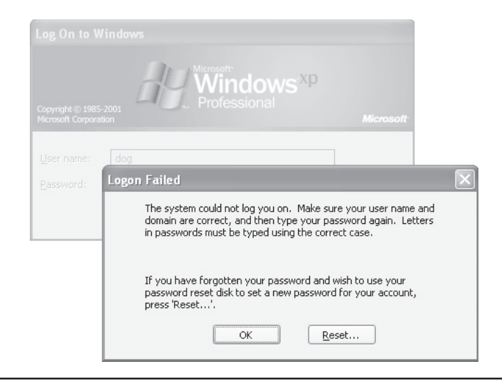
FIGURE 18-5 You can also access the reset disk from the Logon Failed dialog box