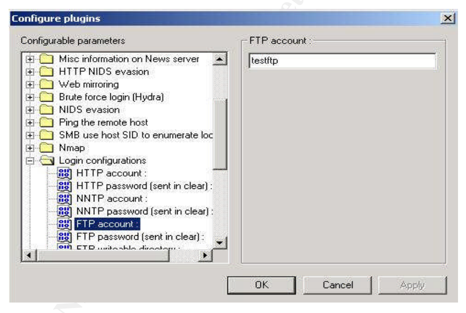
Figure 11 Configure Plugins screen.

Now that we have gone through the basic screens in setting up a scan using the Windows client, a set of test scans will be conducted first with the safe checks activated and the second without the safe checks. For the sake of this test, only the FTP family plugins will be enabled and the port scanners except for NMAP will be disabled. In an effort to improve the accuracy of this scan, a username and password will be provided to Nessus in order for the Nessus server to be able to login to the FTP server. This user has the ability to upload to a test folder on the FTP server. To provide this username and password, the administrator must click on the Configure Plugins button in Figure #9 above. The resulting screen is shown in Figure #11 below. Click on the Login configurations to expand the list of options. In our example, an FTP account name of testftp is typed in along with the password for this account.